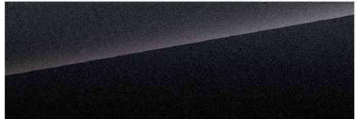
Silver sand black